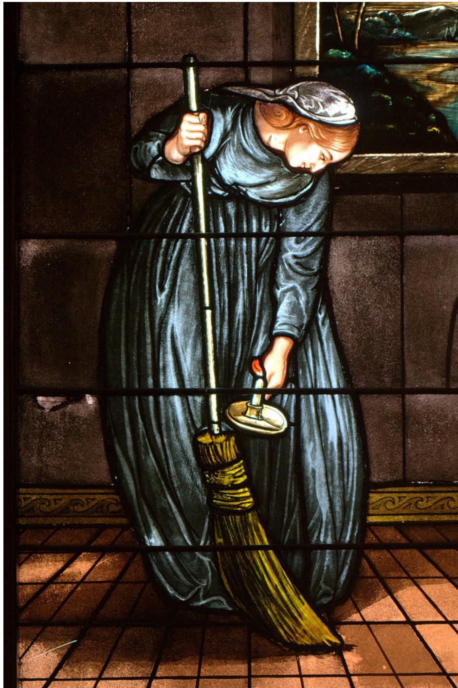
The Lost Coin