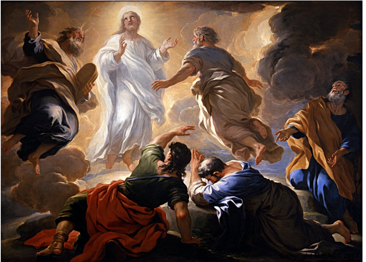
The Transfiguration of Christ. Luca Giordano (Naples 1634 - 1705)

Dominica II in Quadragesima Second Sunday in Lent