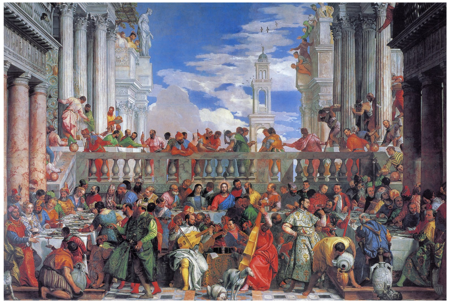
Paolo Veronese. "The Wedding at Cana" (1563)