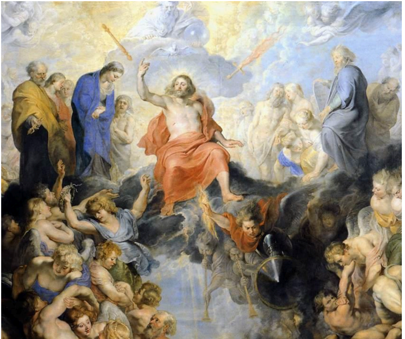
The Last Judgment, by Peter Paul Rubens

Dominica I Adventus First Sunday of Advent