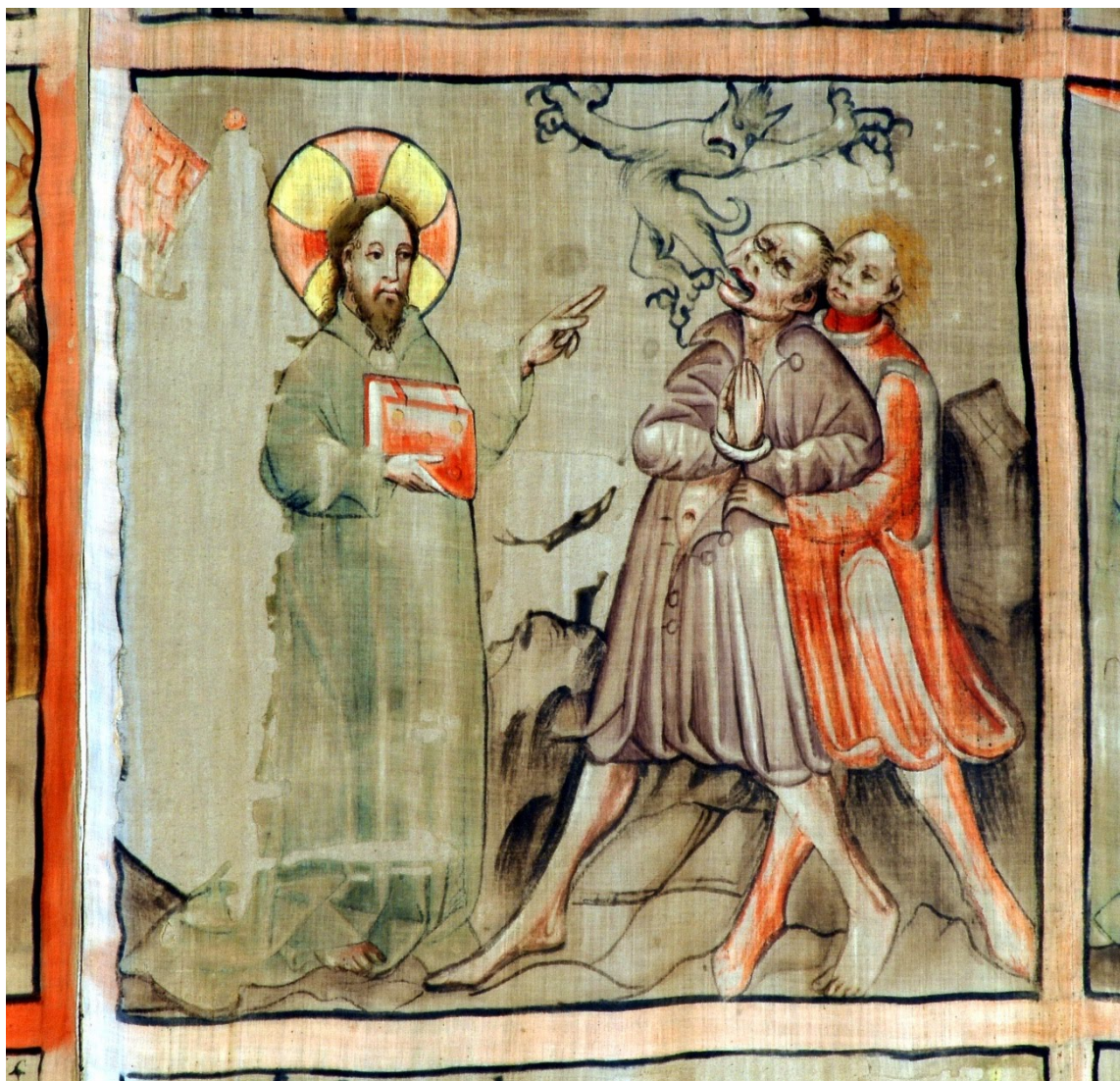
Jesus Christ dispossesses (section of painted scenes on the abstinence cloth in the Cathedral of Gurk, Carinthia, Austria)