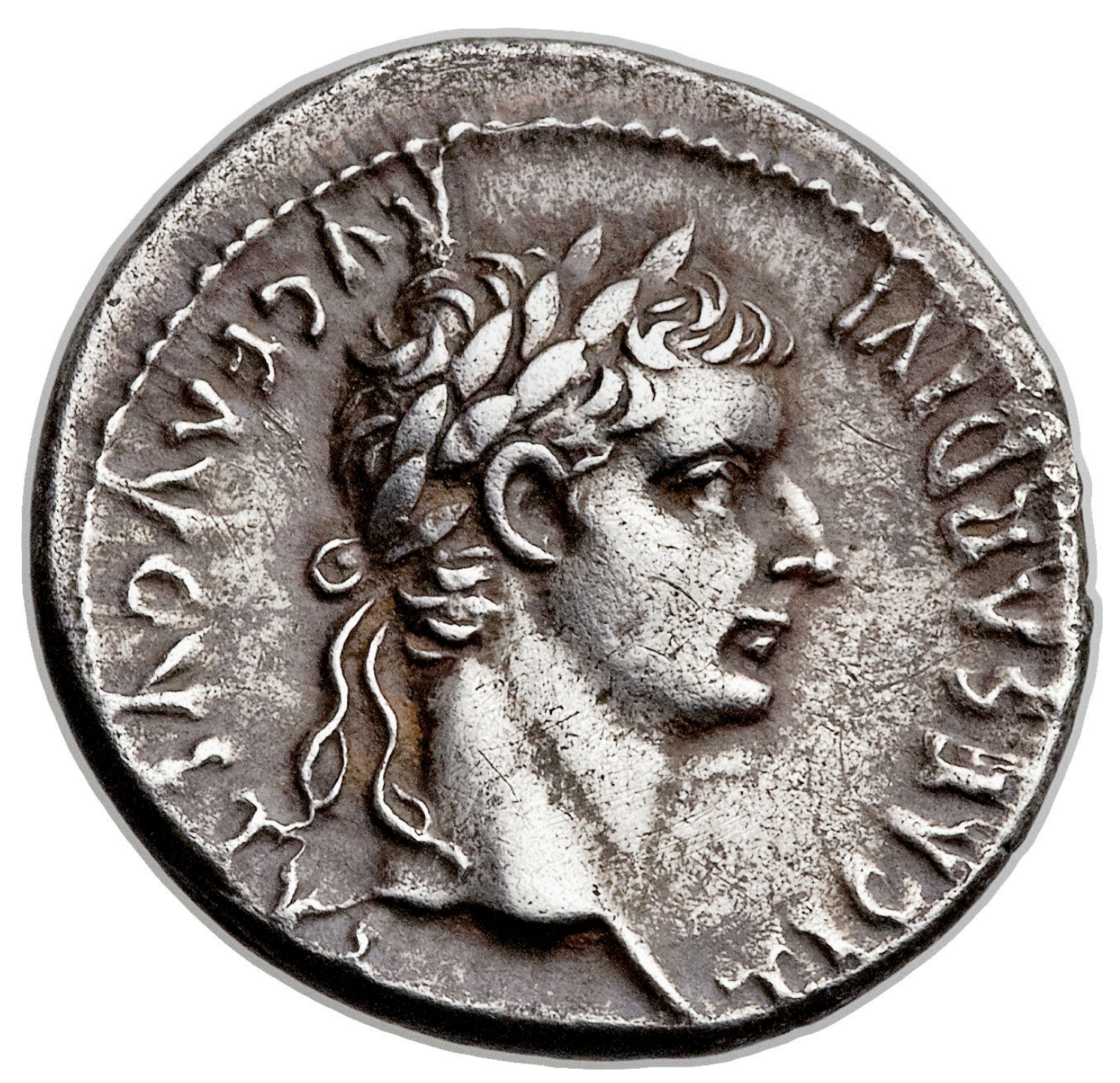
Denarius of Tiberius Caesar

Dominica XXII Post Pentecosten 22<sup>nd</sup> Sunday After Pentecost