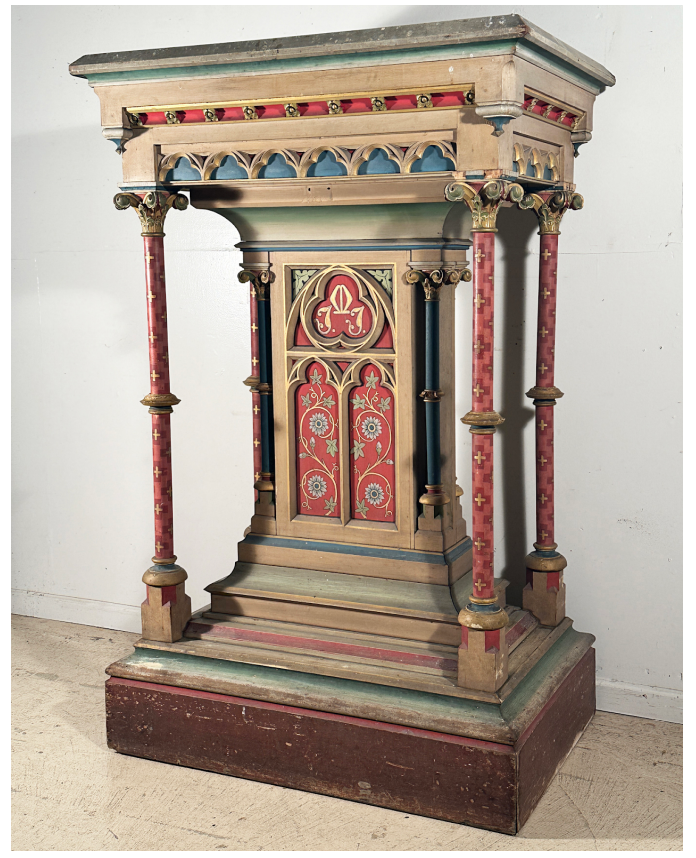
Painted Pedestal. 65"x 42"x 28". $3,250 delivered