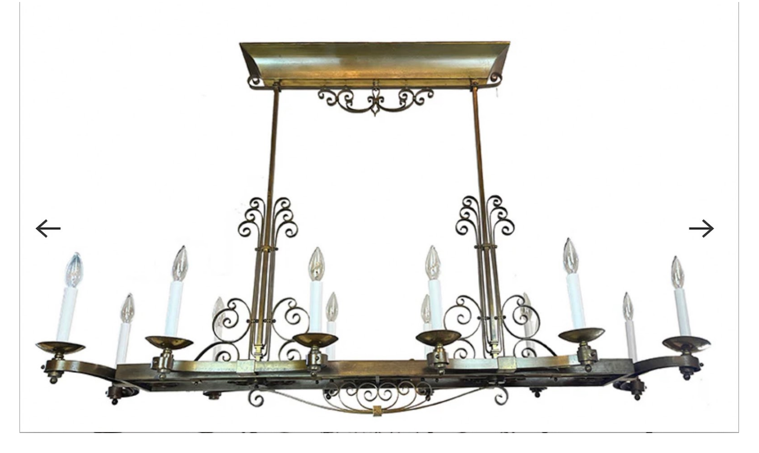
Rare LARGE 53" wide 1930s French Twelve Light Brass Scroll Work Chandelier $3,207. Plus shipping