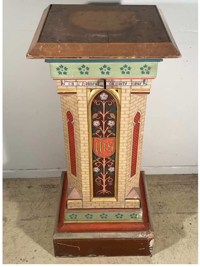
Painted pedestal. It's 50"x18"x17". $2,500 and delivery it for free