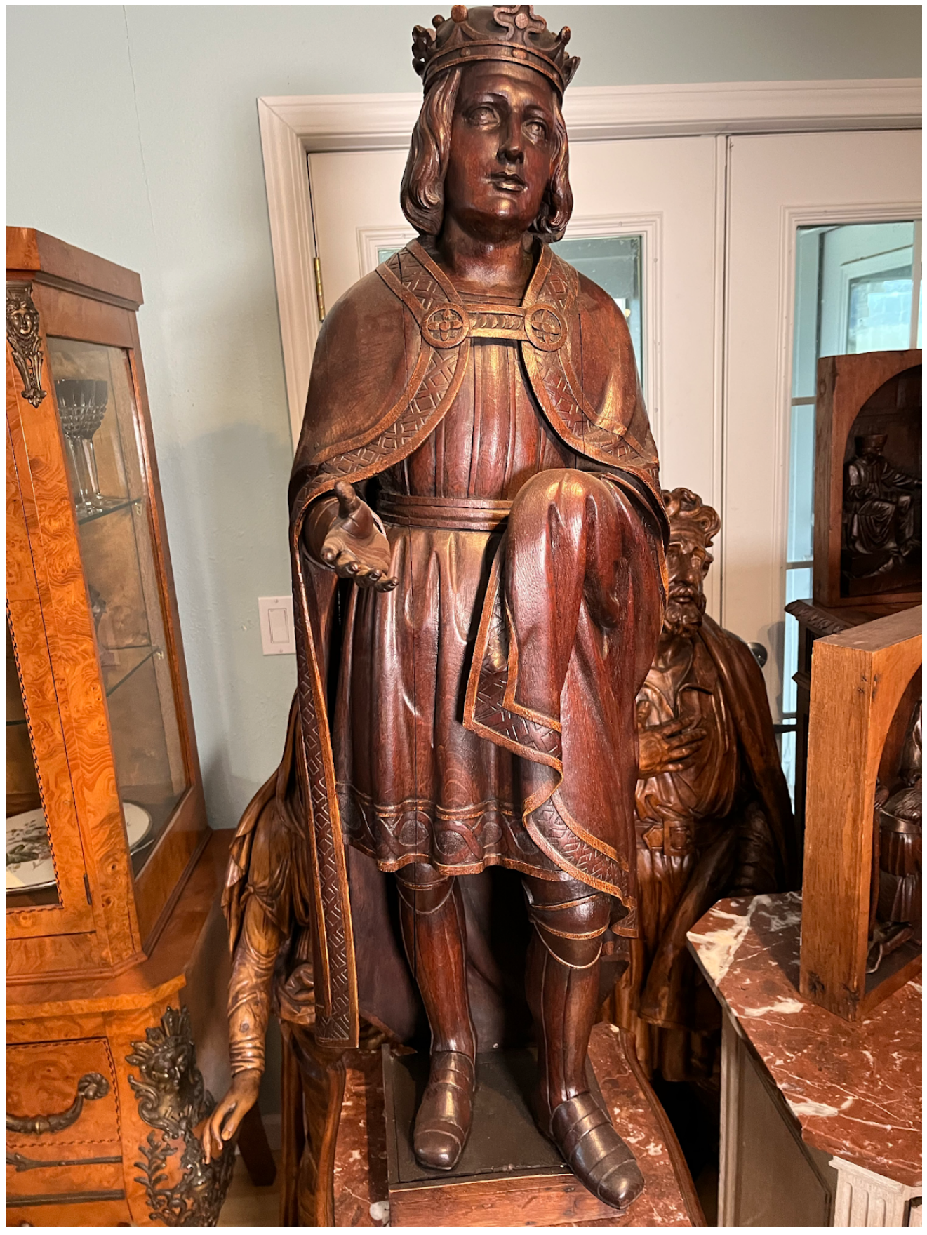
(Sponsored and pledged)