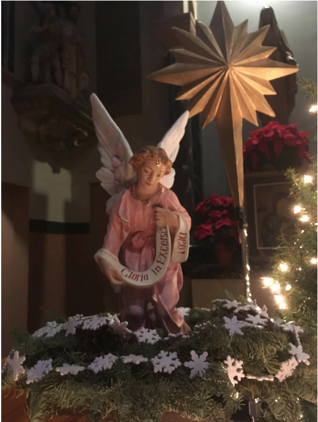
Midnight Mass at St. Stephen's

Dominica IV Adventus 4th Sunday of Advent