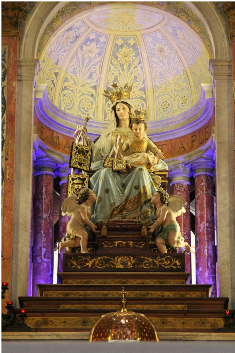
Our Lady of Mt. Carmel, Stella Maris Monastery, Haifa