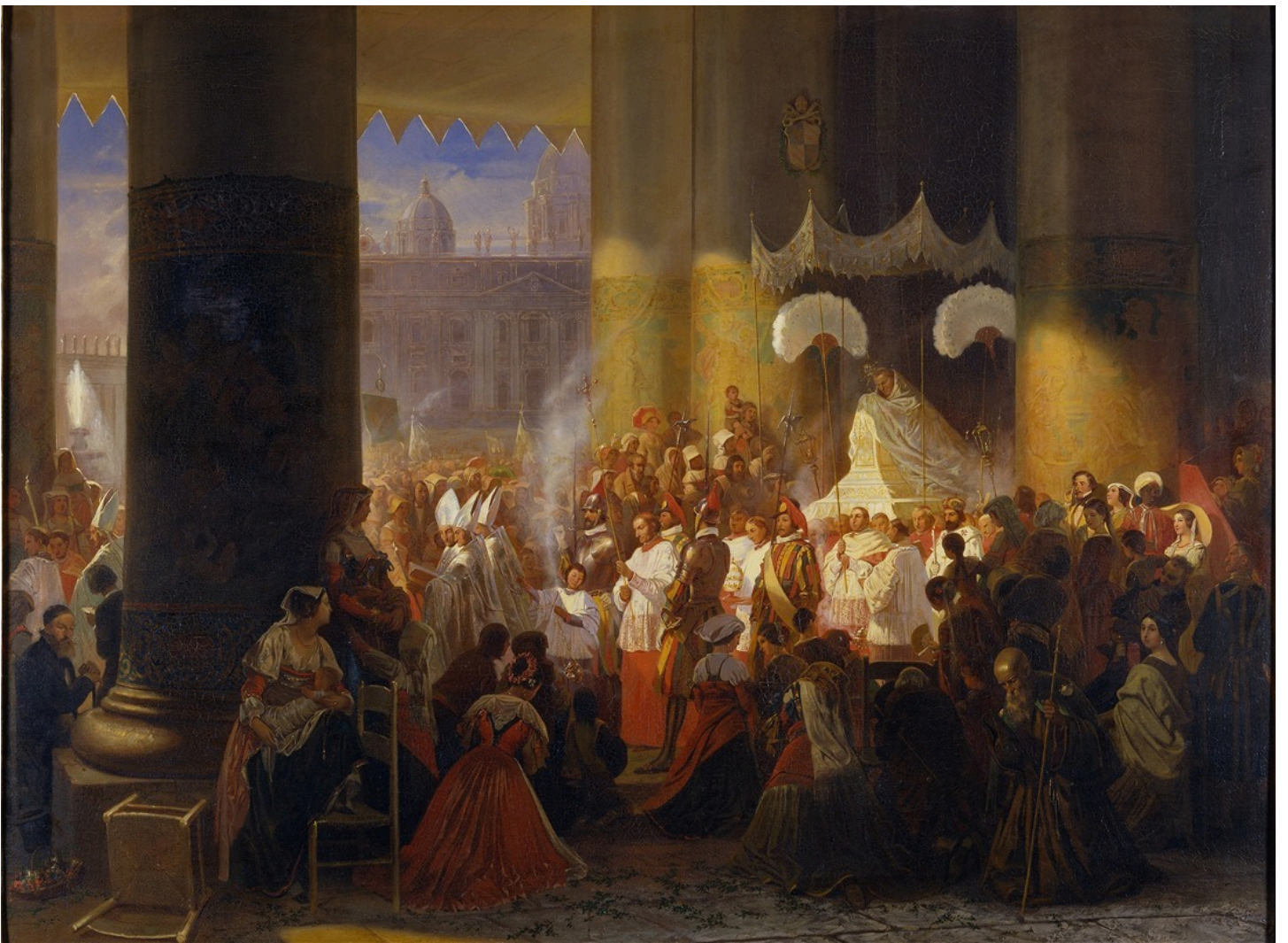
Procession at the Feast of Corpus Christi in Rome, 1847 by Egron Lundgren