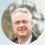
REP. ED DIEHL