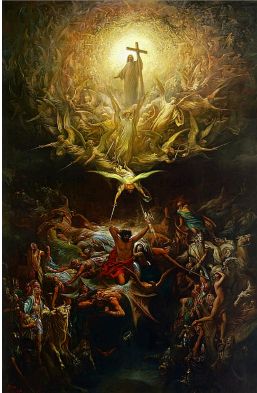
The Triumph of Christianity by Gustave Doré

Dominica XXIV et ultima Post Pentecosten 24 th and Last Sunday After Pentecost