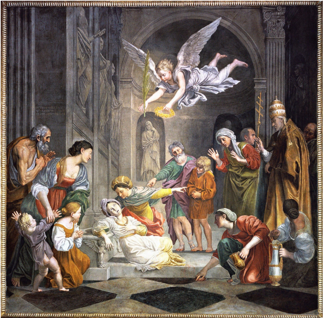
Scene from the Life of St. Cecilia.

Domenichino, San Luigi dei Francesi, Rome. 1612-1615.