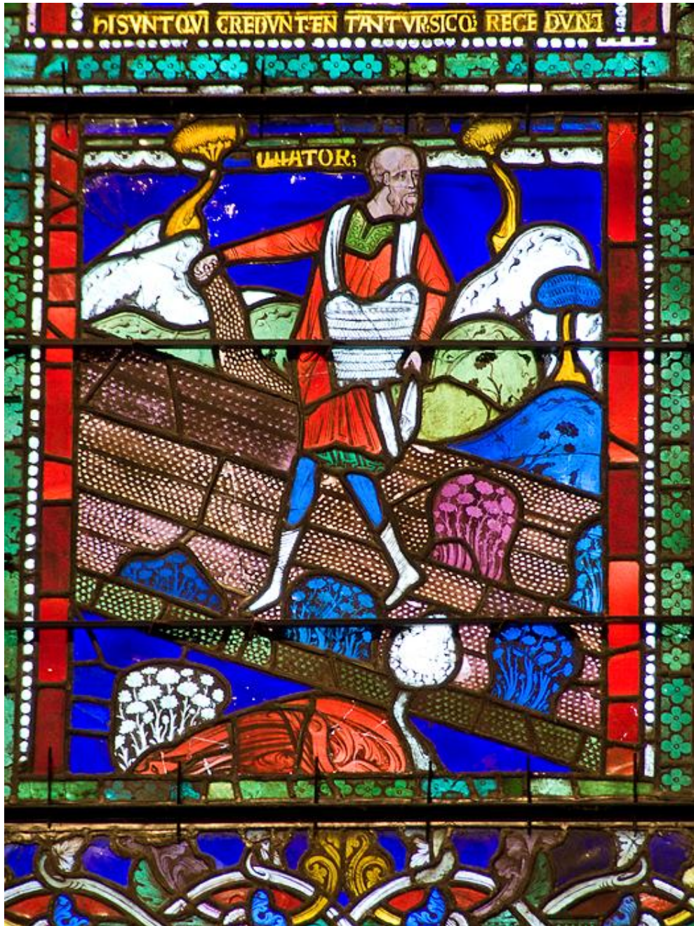
Parable of the Sower, Canterbury Cathedral

Dominica V (quæ superfuit post Epiphaniam)