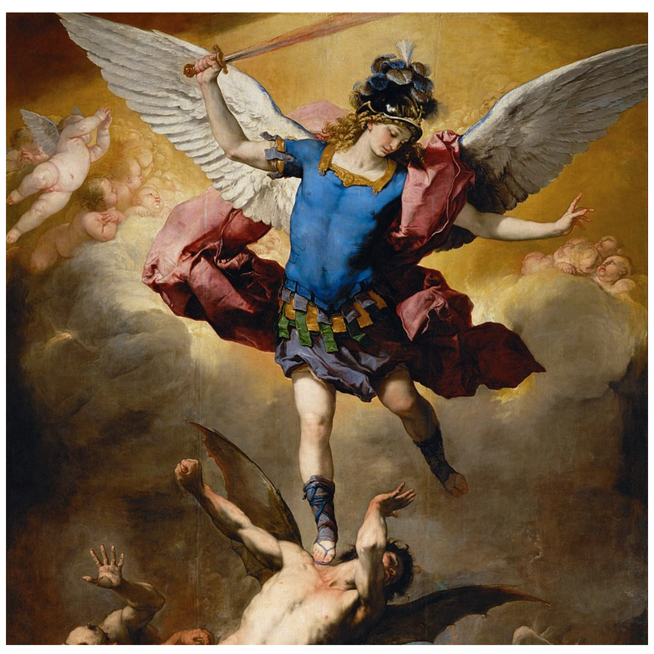
The Fall of the Rebel Angels, Luca Giordano