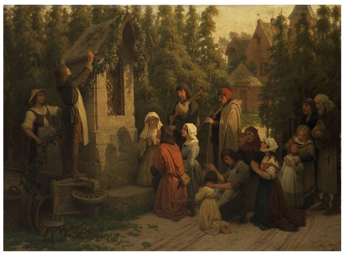
Prayers Before the Harvest, Félix de Vigne