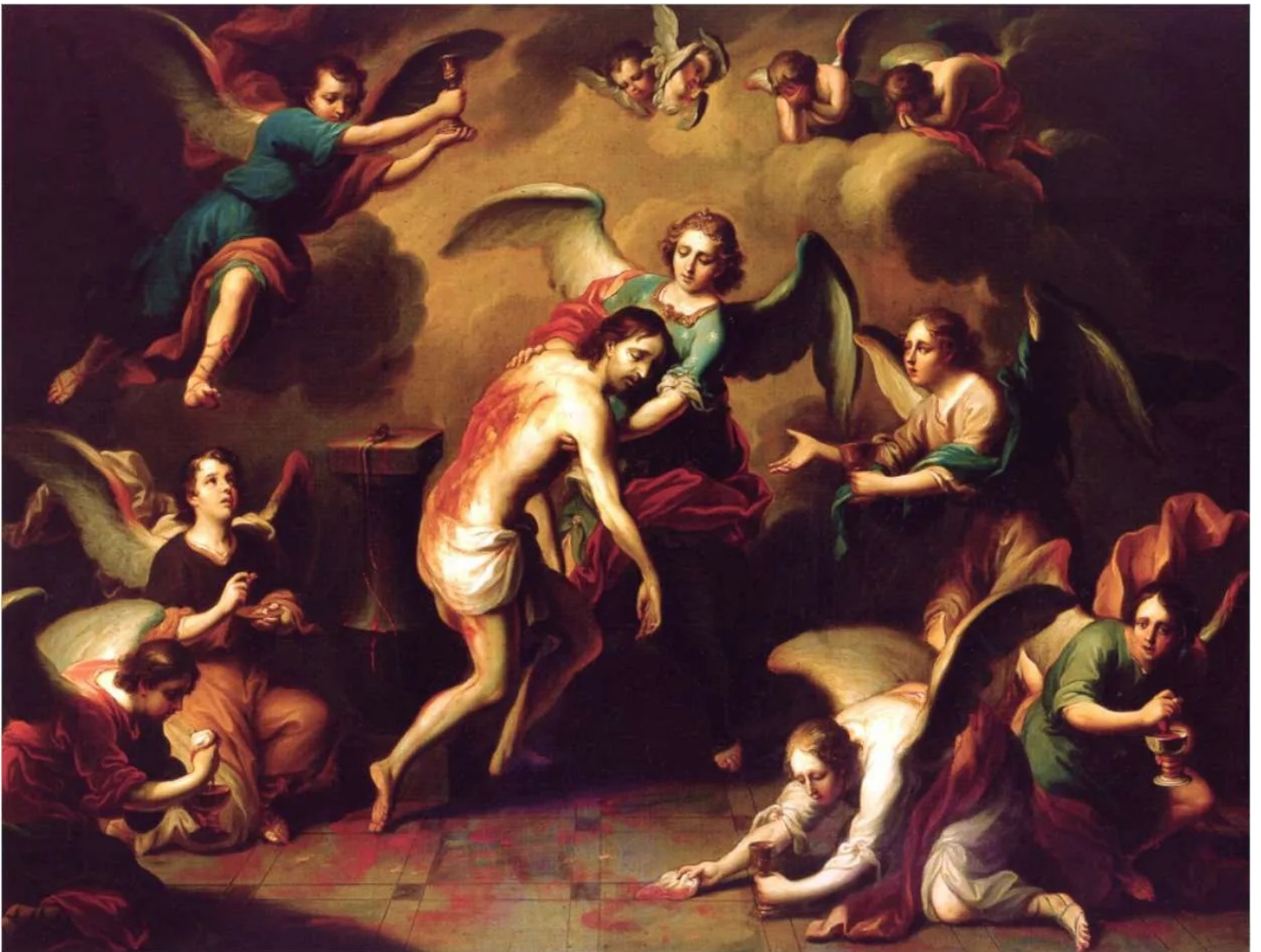
(The Precious Blood of Jesus)