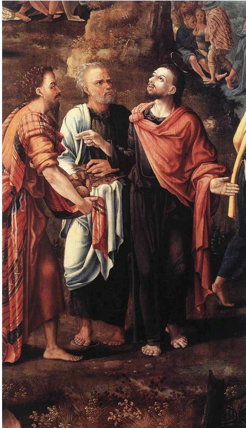
The Miracle of the Loaves and Fishes Lambert Lombard (1505/1506–1566)