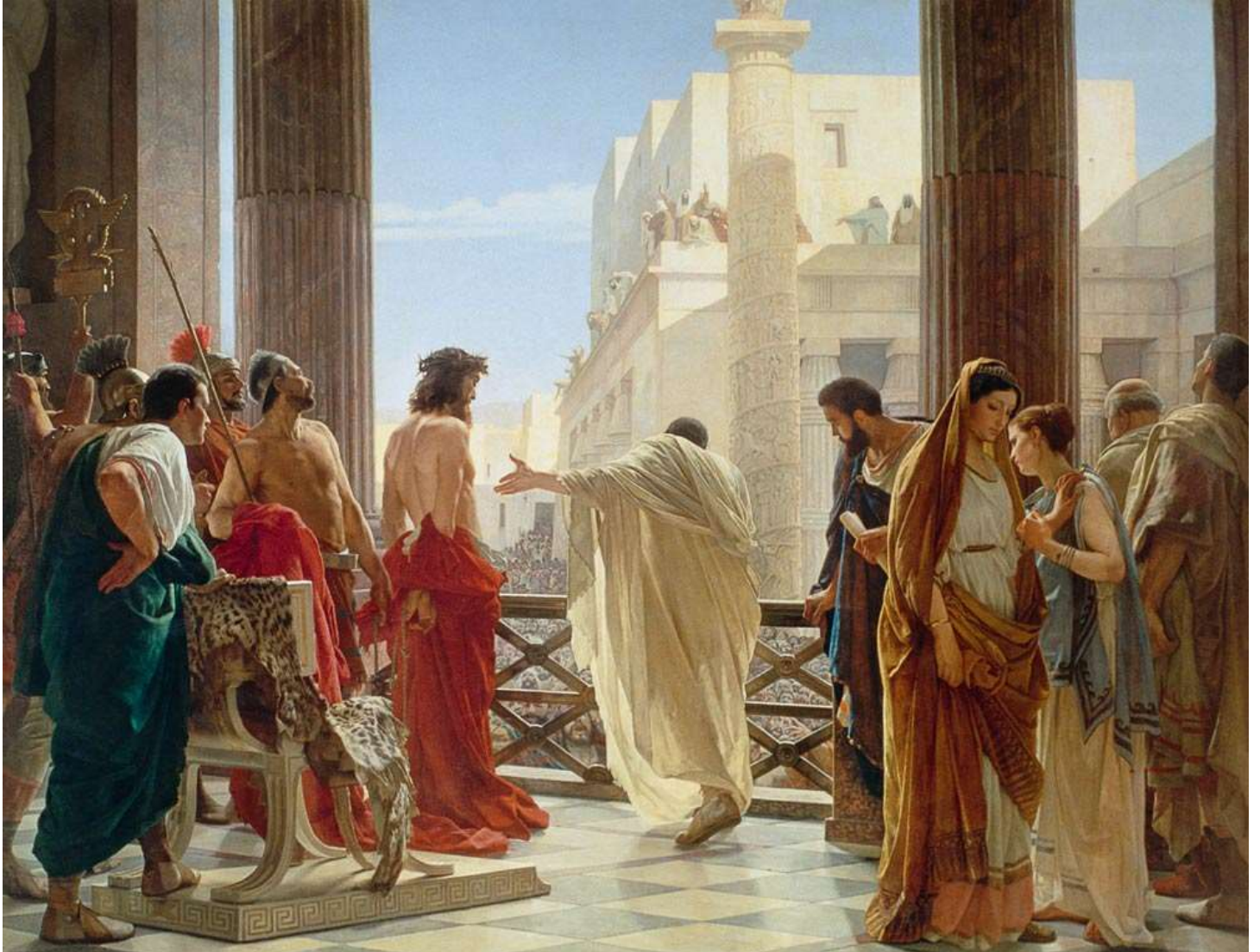
Ecce Homo. Antonio Ciseri 1871