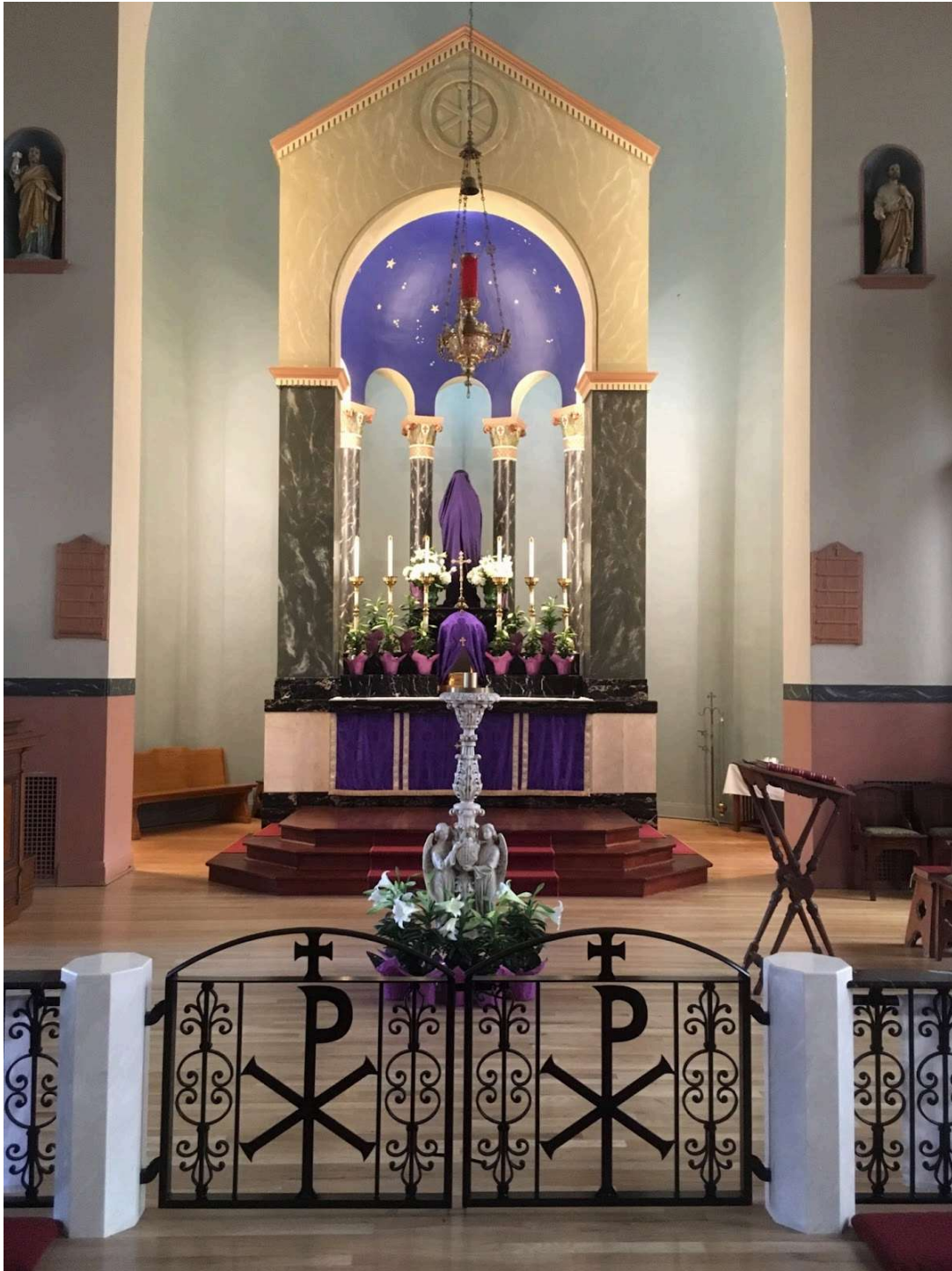
Holy Saturday at St. Stephen's, 2021