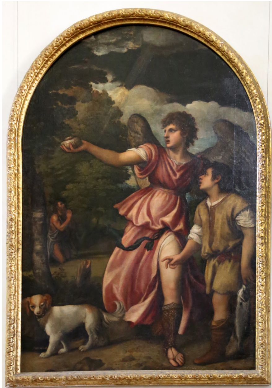
Tobias and the Angel by Titian ca. 1540-1545