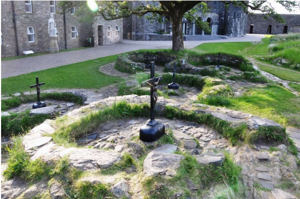
Penitential Stations at Lough Derg St. Patrick's Purgatory, Ireland